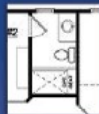
Opt. 3rd Bath